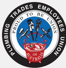
Plumbing Trades Employees Union NSW